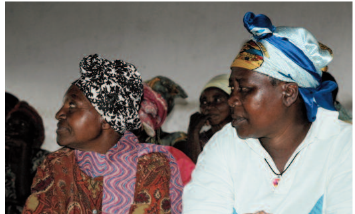
Image: Gathering of midwives in January 2009 to assess needs