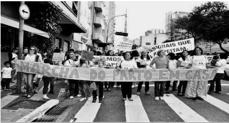
Figure 1. In 31 cities across Brazil, and one in Italy, thousands of people marched for the humanization of birth, for women’s rights in childbirth, and in support of homebirth.