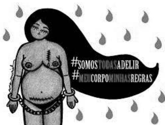
Figure 2. This drawing by Ana Muriel circulated across Brazil as thousands protested Adelir's forced cesarean. Used with permission of the artist.

Other examples of technomedical fanaticism at work include: